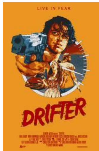
DRIFTER 02/24/2017 Two outlaw brothers (Aria Emory, Drew Harwood) encounter a family of demented cannibals in a post-apocalyptic wasteland.