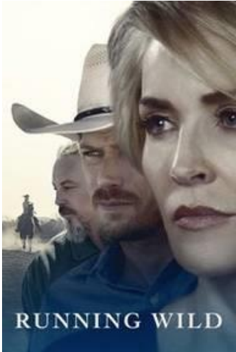
RUNNING WILD 02/10/2017 A widow (Sharon Stone) works with convicts to rehabilitate a herd of wild horses that have wandered onto her ranch.