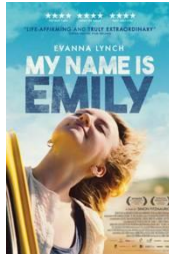
MY NAME IS EMILY 02/17/2017 A teenage girl (Evanna Lynch) flees her foster home with her boyfriend. Their goal is to find her father, a brilliant writer who's been institutionalized.