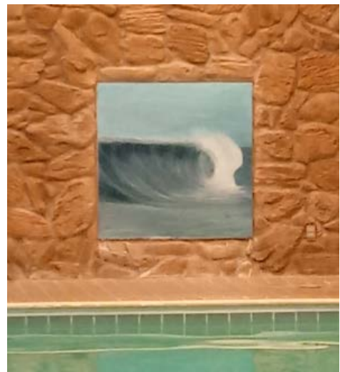
New Painting in the Indoor Pool Replaces the Previous Solar System Painting!

Allied Pest control is willing to spray in November and December under the contract at NO additional charge to the HOA. Due to having not been sprayed for two months and the condition of our buildings post-storm, we believe it prudent to spray every unit over the next two months. January and February 2019 will be "Winter Spray" and any owner who wishes to be sprayed will need to complete an order form for $25 to be charged to their account. The form will be sent in November for owners requesting spraying in January and February.